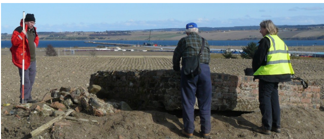
9. The remains of what was probably battle headquarters survive in a field visible from the old and new A9.