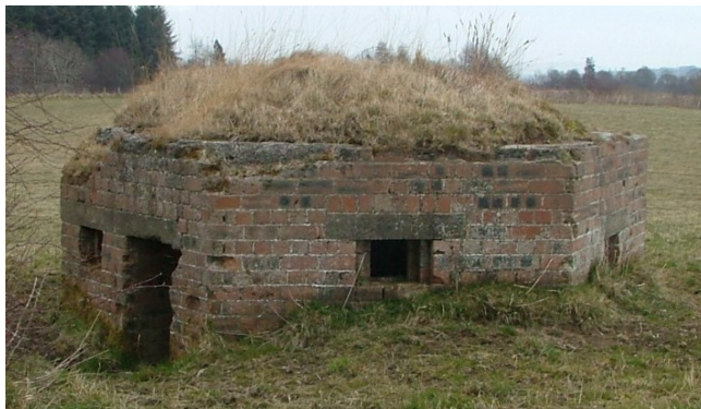
10. At the southern edge of the village, the old wireless station is preserved, along with its pill-box. Originally there were 5 masts on this site.