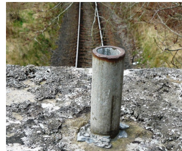
Gun mount on Newton Road North railway bridge