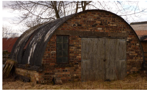
2. Off Beechwood Road are several wartime buildings including this wartime first aid station, a large hangar used now by Munros, and two large Romney huts.