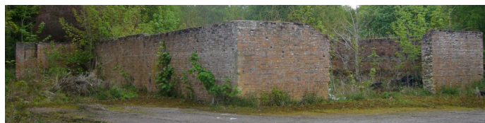
8. At the end of Newton Road north beside the A9 are the remains of a large coal store.