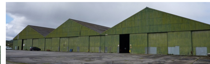
7. The hangars around the Deephaven entrance preserve one of the best clusters of wartime hangars on military airfields. Two were demolished recently. The nearby houses were married quarters during the war.

Please note that many buildings are still in use, while others are unsafe. Please respect private property and do not enter buildings